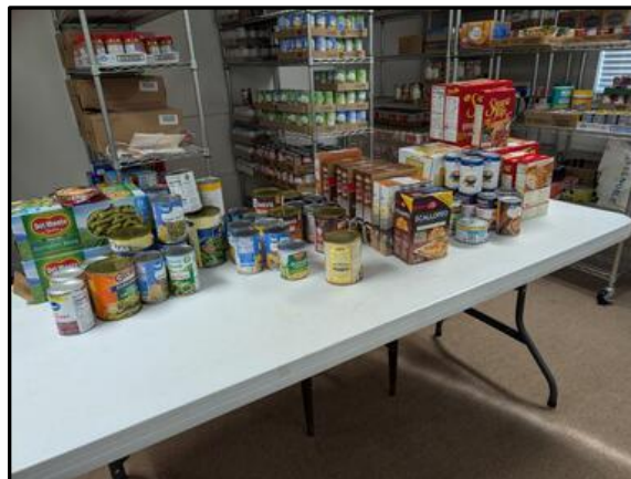
November Luncheon Collections